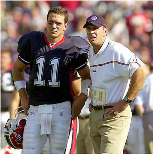
Bledsoe has spent most of his time on the bench this year, advising the coaches rather than running their plays. He won't take many more seasons of the same.